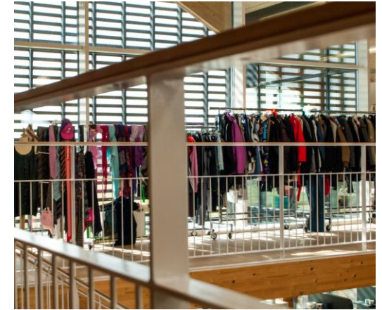
Secondhand shops are increasing in quality

Even if you think someone won't find a use for your old items, don't hesitate to donate! You never know what someone could use, and if it cannot be reused it could be recycled instead.